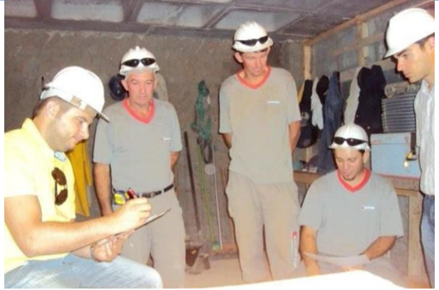
Figure 1. A typical meeting at site work.

According Almeida et al. (2014), the globalization of markets has led many organizations to implement management systems as a differential against the competitors. However, with the variety of available standards, companies felt the need to integrate the management subsystems for the optimization of resources and skills. The sample examined by them consists of four organizations which have IMS with subsystems of quality management, environment management and occupational health and safety. The methodology for data collection was based on semi-structured interviews with the system administrator, which was requested to analyze the whole integration process. The results suggest that integration management subsystem contributes positively on studied organizations. Some factors that administrators reported as essential for integration are the commitment of senior management and the availability of human and financial resources. Among the difficulties that organizations face they noted the absence of a prior organizational structure and changes in employee behavior.